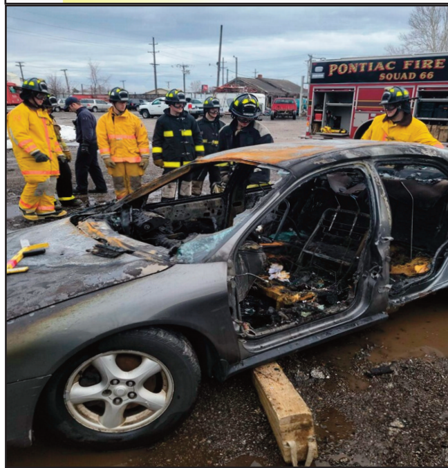
Pictured above: Fire Fighting students worked with The Pontiac Fire Department to practice extrication tactics.