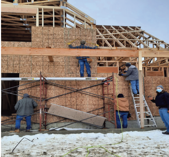
Pictured above: Construction Trades students brave the snow & cold weather while working on their home build project.

According to Construction Labor Market Analyzer, September 2019 edition: Over 1 million skilled professionals will be needed in the construction industry by 2023. We hope to assist in filling this skills gap by getting students interested in the field and providing the entry level construction skills needed to gain employment.