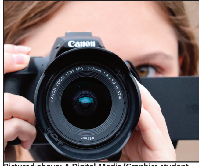
Pictured above: A Digital Media/Graphics student practices their photography skills in class.