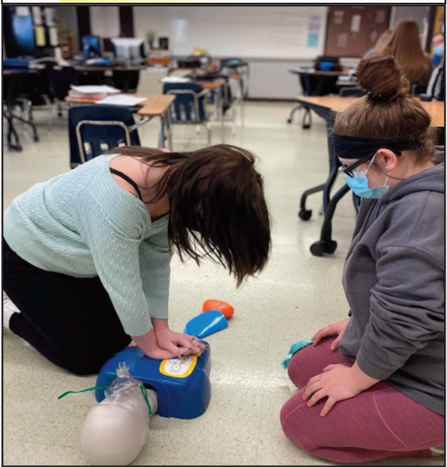
Pictured above: Medical Terminology students learn CPR in while in class. Many LACC classes become CPR certified over the course of a school year.