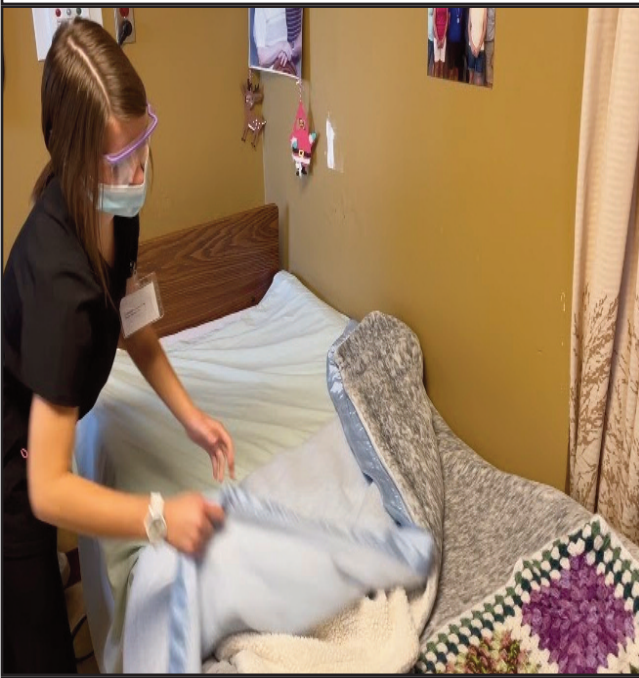
Picture above: A C.N.A. student is shown making a resident's bed while on her clinical time at Evenglow Lodge in Pontiac.

The LACC CNA program is Junior/Senior Students with excellent attendance, academics, and who are seeking entry positions in nursing homes, hospitals, or home health care settings and those students interested in pursuing a career in nursing or other health care occupations. The course focuses on the basic nursing knowledge and skills needed to safely care for individuals with dignity and respect. The course meets Federal and State guidelines for nursing assistant training. Students practice certain skills on each other during classroom and other skills at clinical rotation to Evenglow Lodge and Evenglow Inn. In clinical, they are applying their learning to real life and taking care of residents. This practice is extremely valuable and helps them in real world situations. Upon successful completion of the program, the student will be eligible to take the required competency evaluation for nursing assistants. Students will be certified in CPR before starting clinicals. This course also offers dual credit with Heartland Community College, and students will receive 8 hours of college credit.