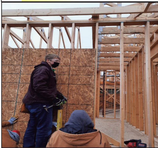
Pictured above: Construction Trades students brave the winter weather while working at the job site for their home build project.