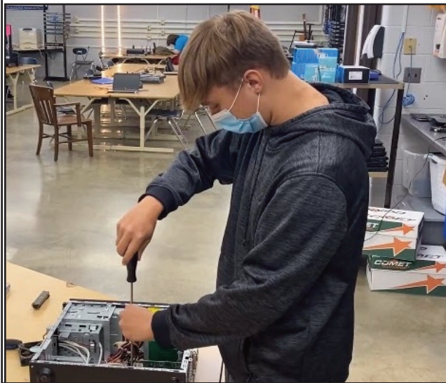
Pictured above: A computer maintenance student repairs a computer tower in class.